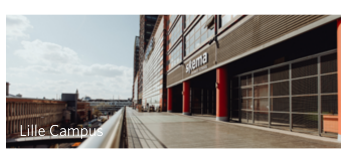
LILLE CAMPUS Avenue Willy Brandt